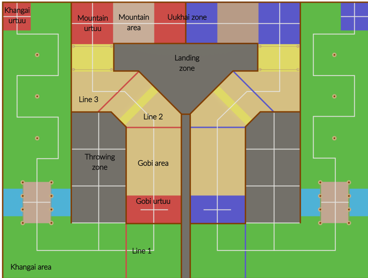
Figure 1. Game field- Areas and Zones